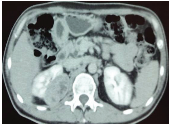
Figure 2. CT scan showing a mass in the right kidney