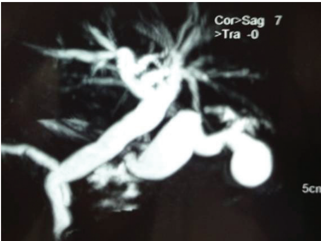
Figure 1. MRI showing dilatation of bile duct.