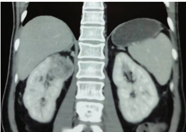
Figure 3. CT scan showing that the tumor was situated in the upper part of right kidney

Here we report an unusual clinical case of a 50-year-old man with metastasis from renal cell carcinoma to the ampulla of Vater. The patient was hospitalized with a one-month history of fever, malaise, fatigue, and jaundice. The patient suffered from diarrhea sometimes and lost 2 kilograms in recent few months. On admission, the patient was pale and anemic. The hemoglobin was 88g/L. Stool was positive for occult blood. Results of pertinent laboratory studies on admission showed: serum glutamic-oxaloacetic transaminase (GOT), 146 IU/L; glutamicpyruvic transaminase (GPT), 324 IU/L; total bilirubin (TBIL), 41 \mu\text{mol/L} ; carcinoembryonic antigen (CEA), 5.6 ng/mL. MRI